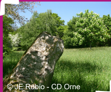
© JE Rubio - CD Orne