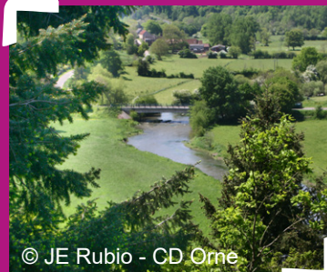
© JE Rubio - CD Orne